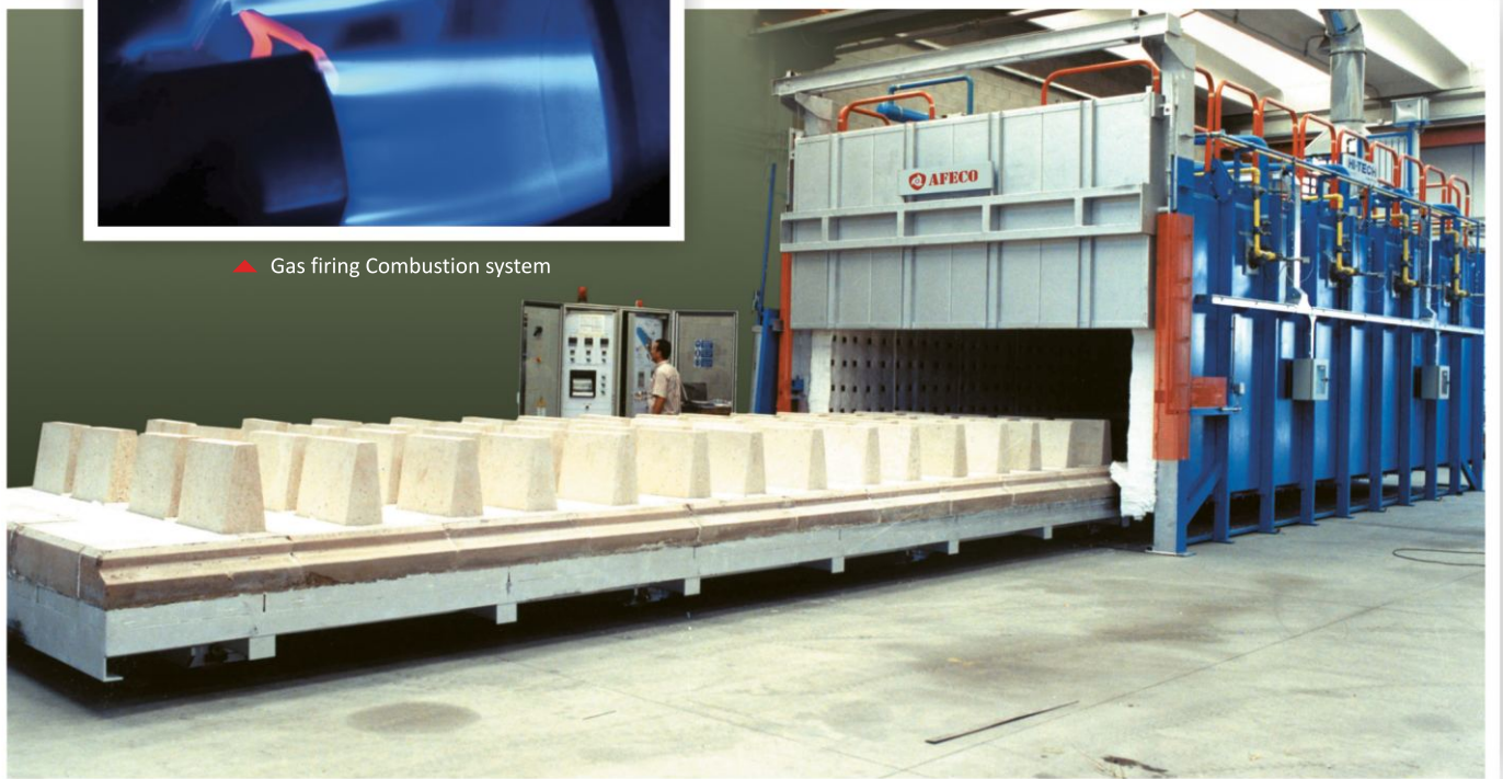
▲ 10 Mt capacity Gas fired car bottom heat treatment furnace for 1200°C Temperature.