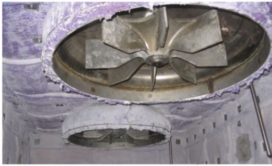
▲ Air circulation fan